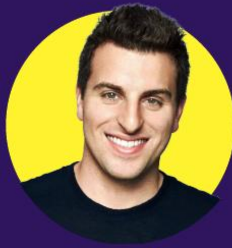
BRIAN CHESKY Co-Founder & CEO Airbnb