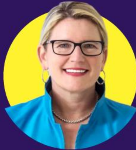
JOANNA GERAGHTY CEO JetBlue